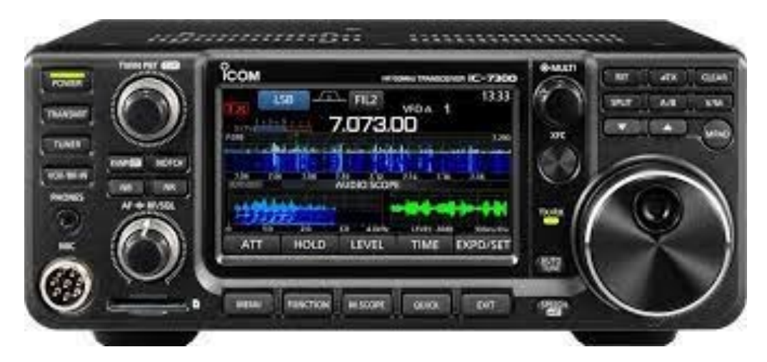
The Icom IC-7300, right, is another radio that is part of the 4-H club's radio lineup.