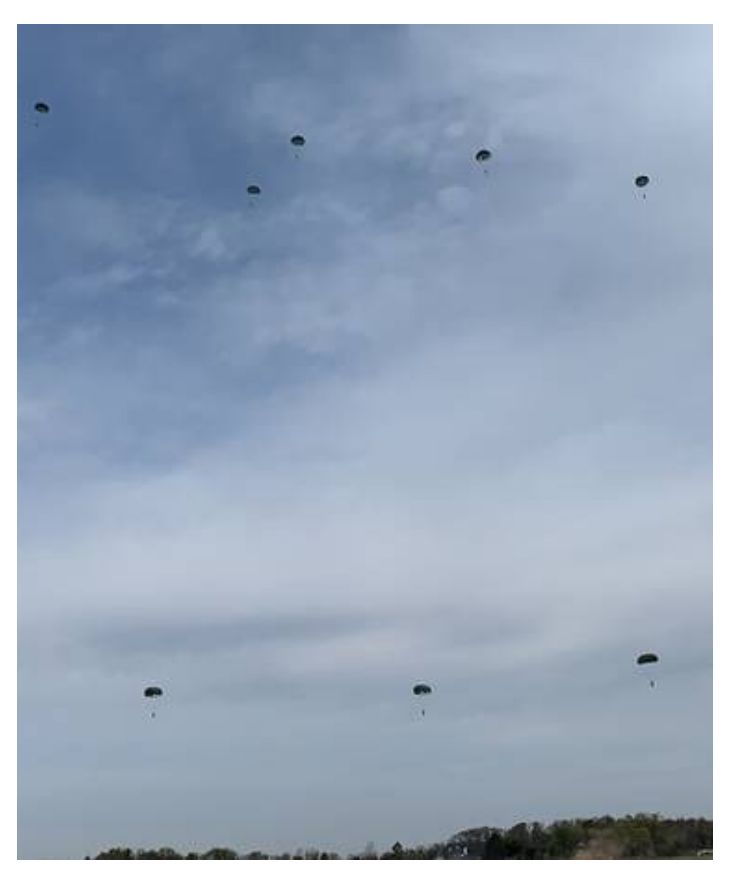
Image: Paratroopers in honor of Pee Wee Martin.